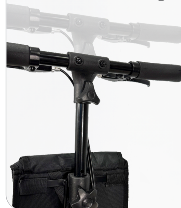
Adjustable Handlebar Height