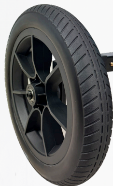
Large 12" Front Wheels