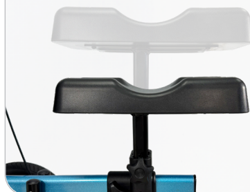
Height Adjustable Pad