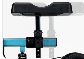
Position Adjustable Pad