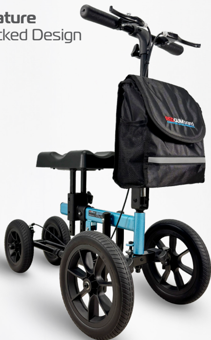
Feature Packed Design